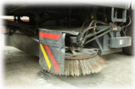
Main Broom & Vacuum area