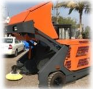
5.315 Ft. Hopper Uplift