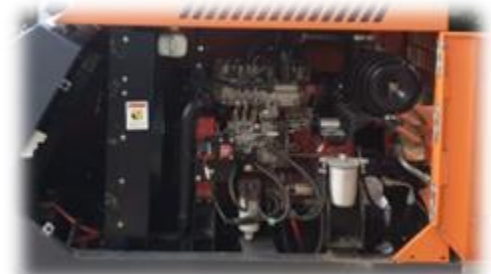
59 HP -Engine